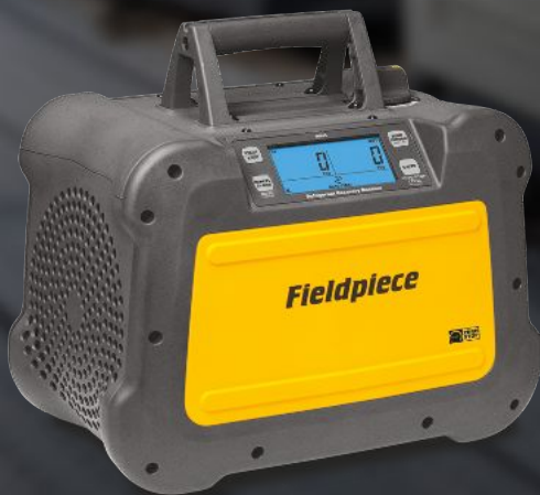
Recovery Machine MR45INT