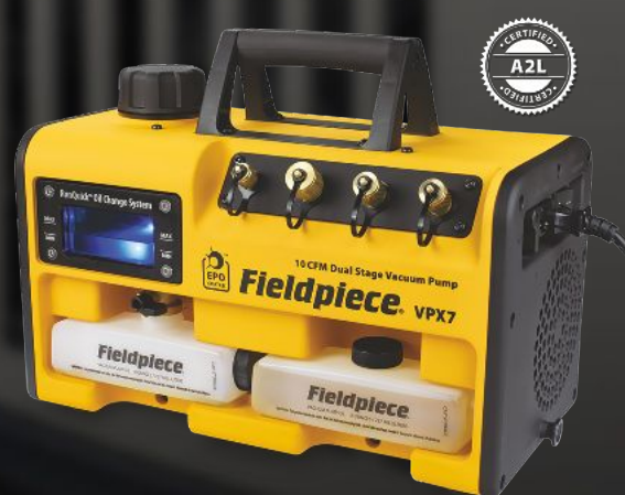
Vacuum Pumps VPX7INT, VP87INT, VP67INT