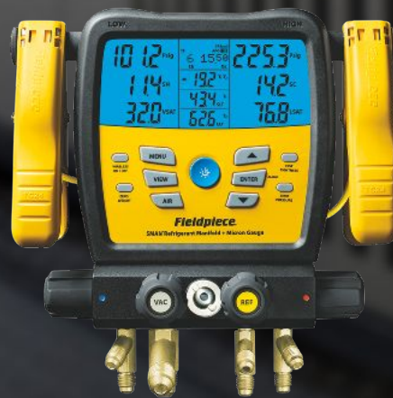
Refrigerant Manifolds SM480VINT, SM380VINT